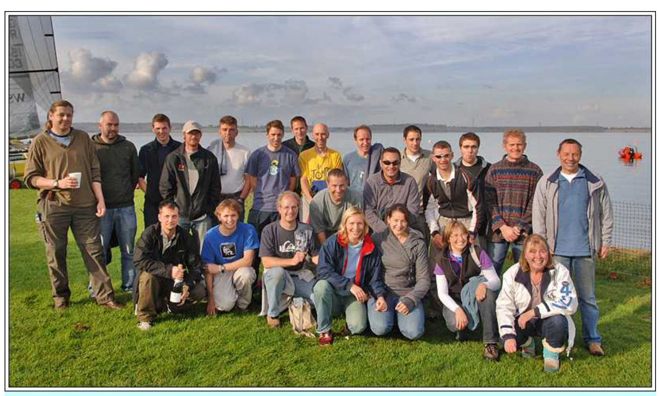
The end-of-term class photo from the Inlands at a very glassy looking Grafham Water – photo Copyright Tania & Sergei Samus Photography (www.photoblink.co.uk). Brave jumper Barnsie (or did Pete decorate it for you...)