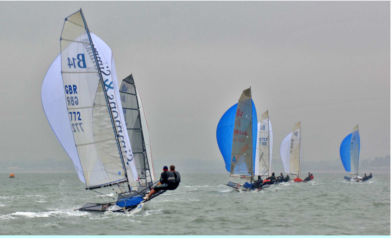
More 2008 Nationals action – blue seems to be the colour here.