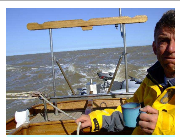
Half of the Ed. enjoys a nice cup of tea on his holidays. He hasn't noticed the flubber surfing up behind him at high speed...