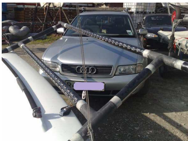
The shape of wings to come (sorry, that is the best I can do) – these are on Phil Eltringham's boat, GBR 777 Ovington Boats