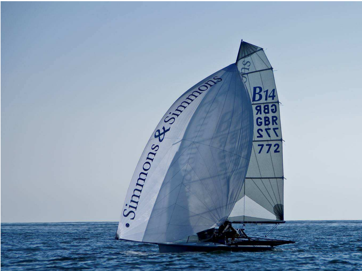
Final Fling 2008

This year is going to go down in history for all the wrong reasons sadly. I think we can safely say that we must have done something to offend Mother Nature and she has been getting revenge throughout the season with poor weather at many of the events this year. In fact I think the best sail I had in 2008 was in the summer like conditions that were laid on in Plymouth Mid October!